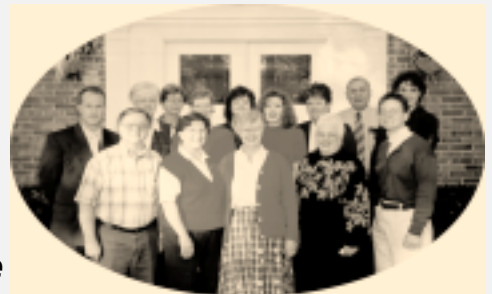
New Editor for Quaker Life Magazine