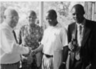
Cuba Friends Celebrate Centennial